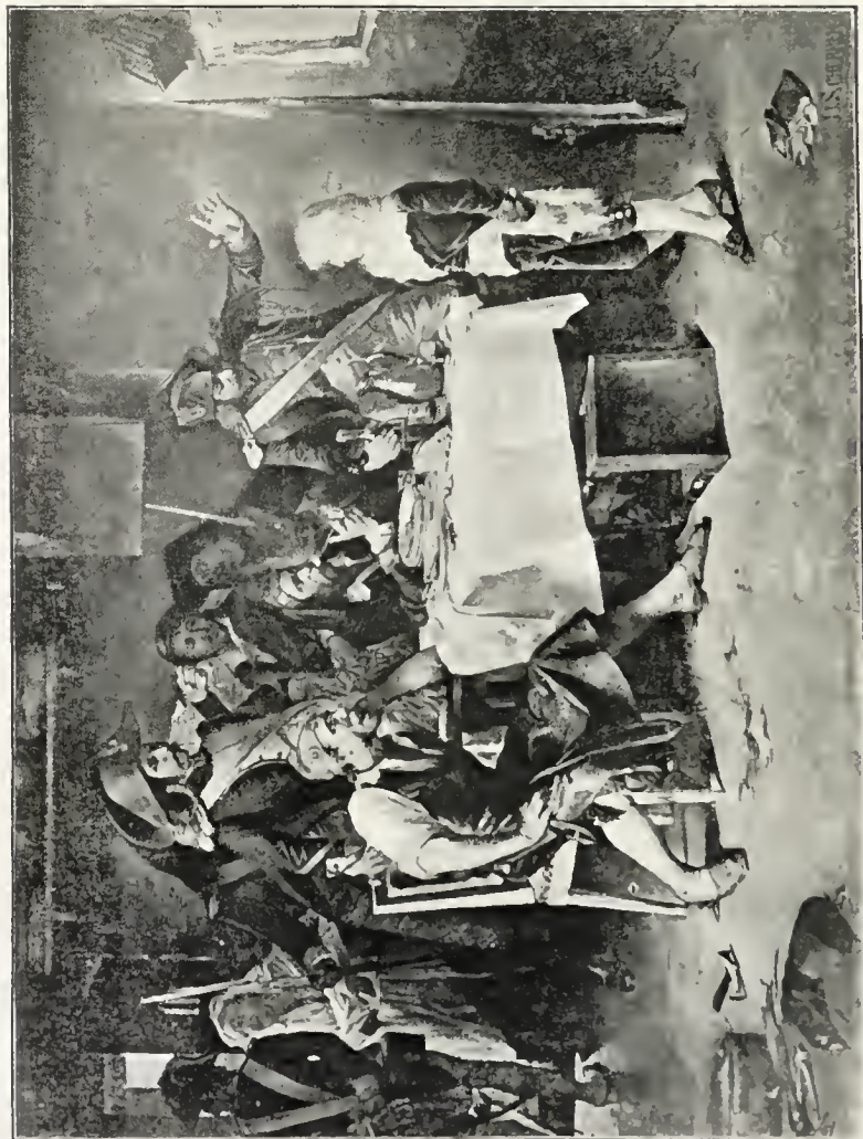
LOUIS XVII. IN PRISON. FRONTISPIECE—Carlyle, Vol. Ten.